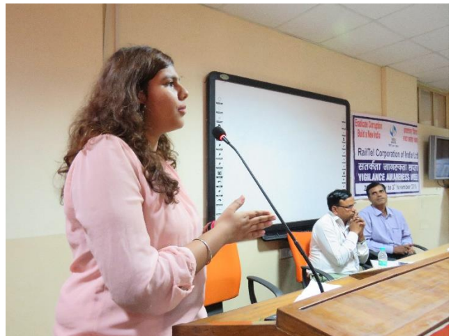
(Event at Apeejay Satya University)