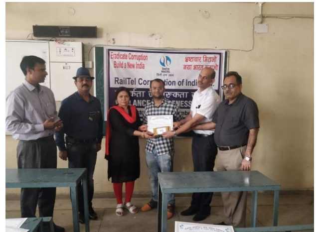
(Event at Govt. PG College)