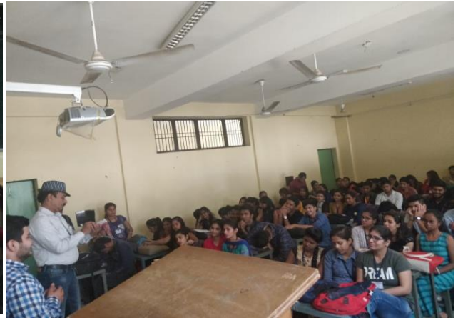
(Event at Kendriya Vidyalaya)